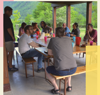
Discussions happened in the shade and in the sunshine.