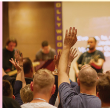
One of the many mobile phones involved in the worship times!