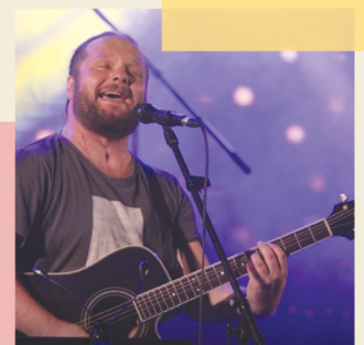
Singing songs he wrote from the album Svjetlo