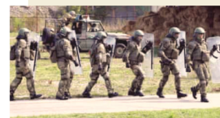
'Very real' prospect of conflict / Bosnia in danger of breaking up, warns top EU official