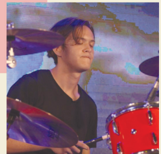
First time playing out on the street for these guys