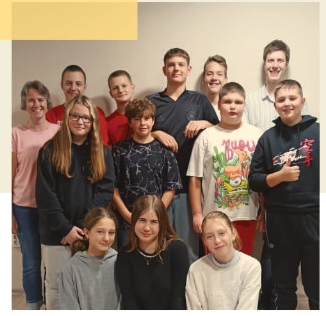
Meeting teenagers who are involved with Novi Most in Tajce