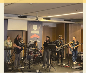
Watching Budo soundcheck with the band in Sarajevo