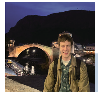
The “I was there” photo with the Stari Most in Mostar!