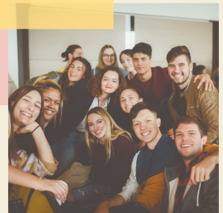
Friends from different towns and different countries.