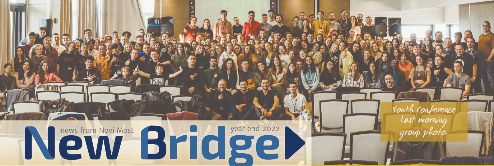
Youth Conference Last morning group photo.